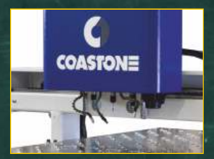
MultiTapper MT1212 for tapping and counter sinking.