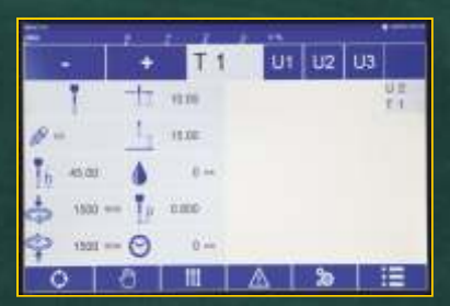
MultiTapper MT1212 touch screen control.