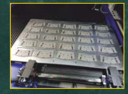
TapOne 1212. Positioning with clamps.