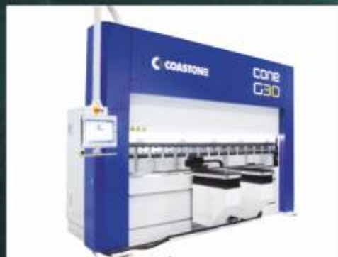
G-Series Cone G30. O-frame machine with sheet followers.