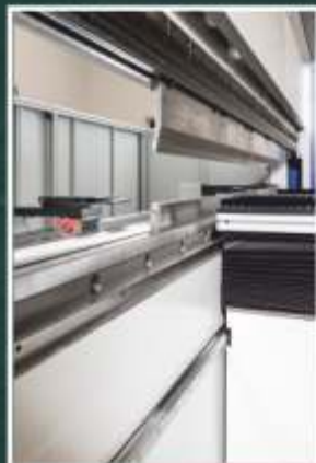
600 mm daylight (G-series). Wila tooling.