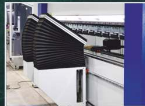
Servo electric sheet followers.