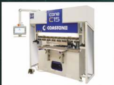
C-Series Cone C15, C-frame machine.