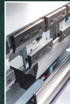
Promecam tooling (European style tooling).