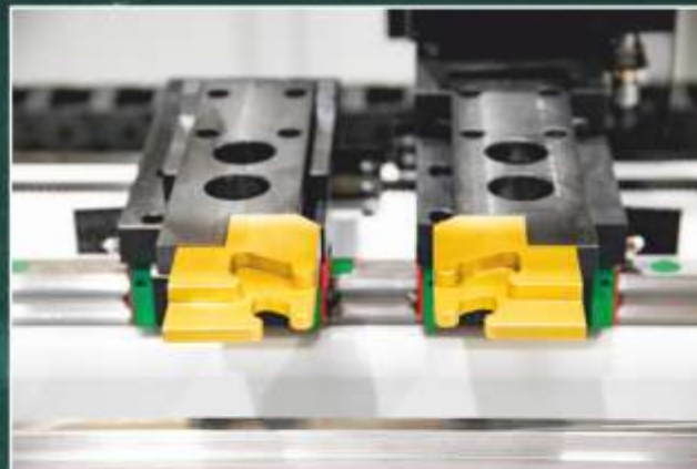
Multi AXIS 3D back gauge stop.